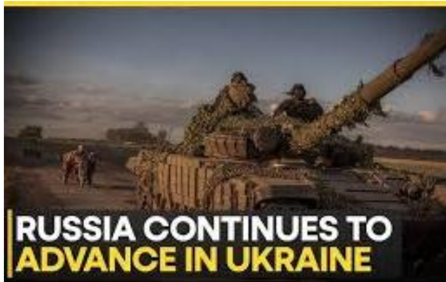
Figure 1 Changing Profile in Three years and Beyond

Russo-Ukraine war has shown so many hues, twists and turns in its currency of three years and counting that it is difficult to keep a count. Just to set the perspective for the analysis, here is a brief re-count: -