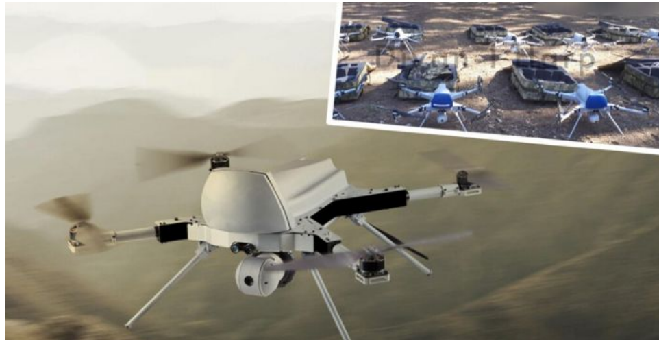
The Turkish Army has deployed 500 plus Kargu swarming drone systems for kinetic attack