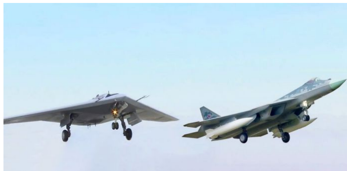
Russia's S-70 Okhotnik loyal wingman with a Su-57 fighter