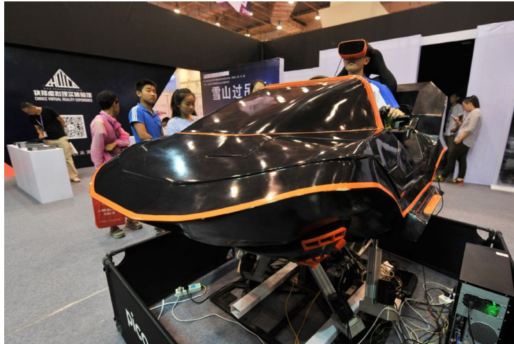
(A visitor tries Pico's VR device during an expo in Qingdao, Shandong province.)

be widely accepted by the public 36 . Chinese tech giant ByteDance, the owner of popular short video-sharing app TikTok, made its first foray into VR by acquiring Pico, a Chinese VR headset maker 37 . Founded in 2015, Pico emerged as the world's third-largest VR headset maker in the first quarter of 2020, followed by Facebook's Oculus and Chinese company DPVR, according to global market consultancy IDC. IDC also predicted that, global VR products will grow at the compound growth rate at about 48 percent up to 2024. In 2025, global AR equipment shipments will reach 24.4 million units 38 .