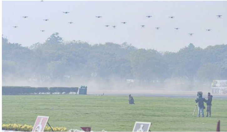
Indian Army demonstrated a 75 drone heterogenous swarm on Army Day 2021 in New Delhi