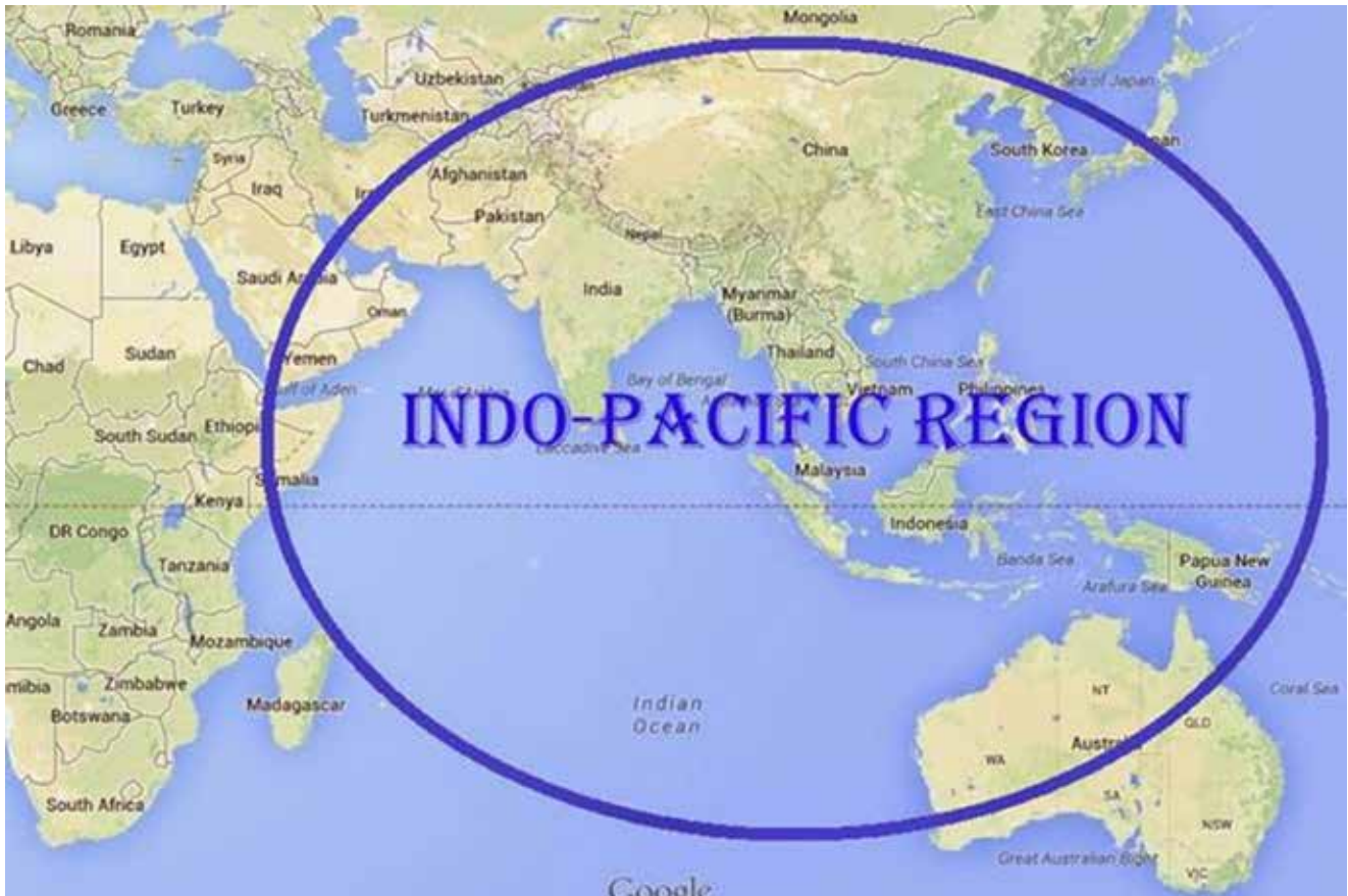
Indo- Pacific Region 2

some of the busiest sea lanes in the world. The rise in commerce has created political and strategic interests, along with concerns that these interests may be under threat with the rise of China and its assertive maritime behaviour.