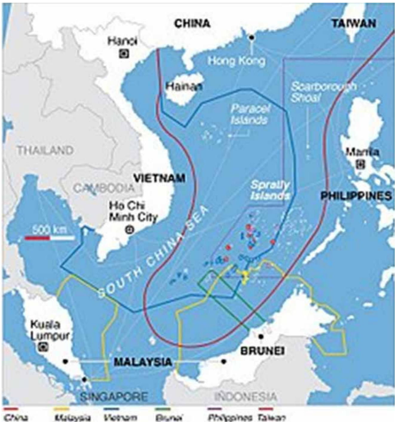
South China Sea Region

as Taiwan) claim almost the entire body as their own, demarcating their claims bounded within the nine-dotted line. Besides, Vietnam, Philippines, Malaysia, Indonesia, Brunei and Singapore are making conflicting claims on some group of Islands / straits countries making competing claims. ASEAN states are keen that the territorial disputes within the South China Sea do not escalate into armed conflict. China favours bilateral dialogue but, fearing of being bulldozed in discussion ASEAN States favour multilateral dialogue. Smaller nations can gain leverage over China only if they force it to negotiate in multilateral forums. The South China Sea is thus the biggest flashpoint for potential conflict between China and neighbours like Vietnam, Philippines, and others.