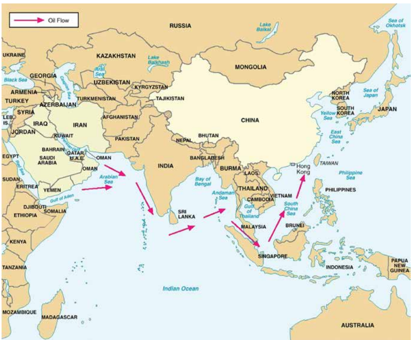
The Chinese Oil Flow 3

China depends for 80% of its energy needs from west Asian oil sources which is transported through the Malacca strait. The pipelines supply from its various external sources can just meet 20% of its energy need hence; its dependence on west Asian resource will remain. To ensure safety of its Sea lines of Communication (SLOCs), it would use its naval power which is growing exponentially. At the same time, the China is engaged in developing naval bases in the Indian Ocean. Its Navy has already gained some out of area operation experience by operating for anti-piracy role and maintaining a naval base at Djibouti and developing similar bases at Maldives, Gawadar/Jiwani in Pakistan, and Hambantota in Sri-Lanka etc. Chinese intent becomes clear with its deployment of submarine along with the naval ships in the Gulf of Aden in antipiracy role.